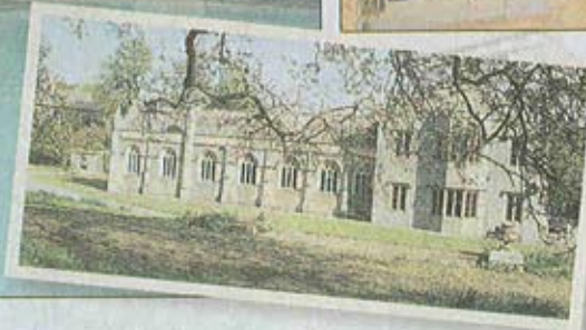
Clean and green: Trelowarren Estate has been constructed to exacting environmental standards in both its restored and new buildings. Even the pool is cleaned without harmful chemicals